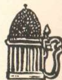
PATENT STAR-LIGHT NIGHT LIGHT